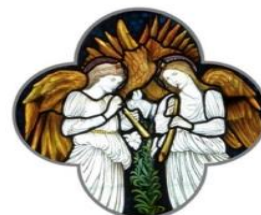
Easthampstead Parish Church

Every Wednesday 3-3:45pm in St Michael's Parish Centre (during the school term), we welcome any member of the Easthampstead community to donate, collect, share and reuse items so that all may thrive. Come along for a brows and refreshments.