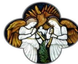
Easthampstead Parish Church

Every Wednesday 3-3:45pm in St Michael's Parish Centre (during the school term), we welcome any member of the Easthampstead community to donate, collect, share and reuse items so that all may thrive. Come along for a brows and refreshments.